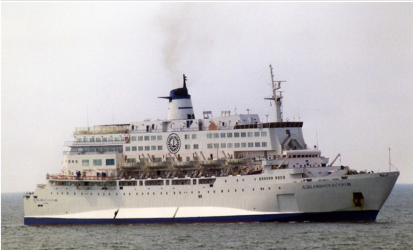
AL SALAM BOCCACCIO 98 - IMO 6921282-CC via shipspotting.com

BY Egypt Today - Fri, 08 May 2020 - 03:37 GMT